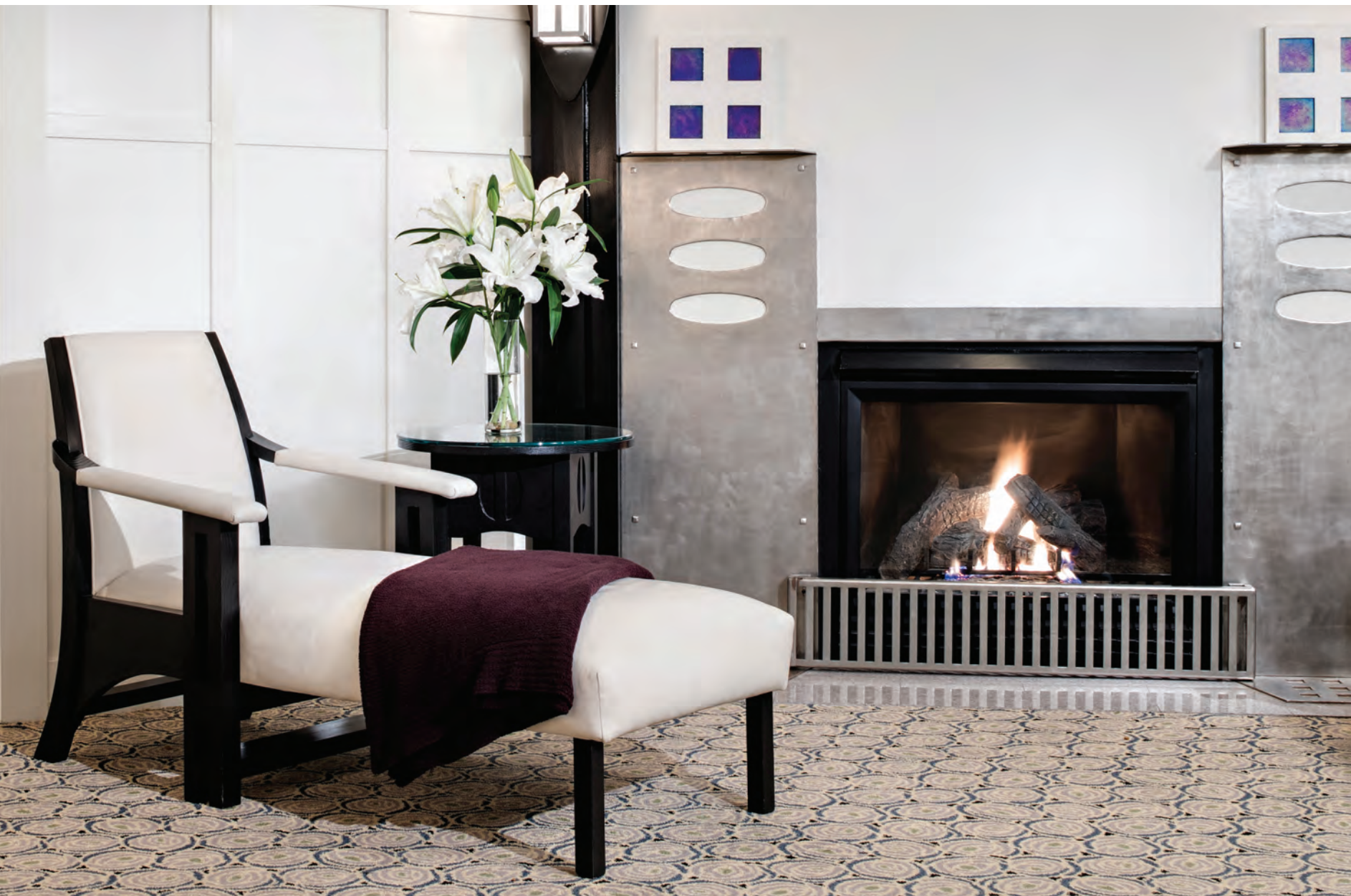
THE SPA AT TORREY PINES